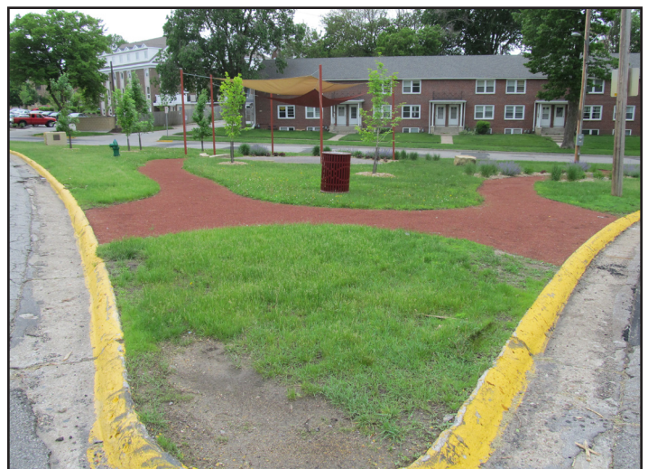
The DZ Triangle Neighborhood received an NIP grant to renovate the public space located at the intersection of Sunset Drive and Pearson Avenue. Pillars, a brick patio, native grasses and shrubs, seating, paths, and park signage were installed.

For more information about the Neighborhood Improvement Program or the application form, visit www.cityofames.org/NIP , or contact Diane Voss, City Clerk, at 515.239.5105.