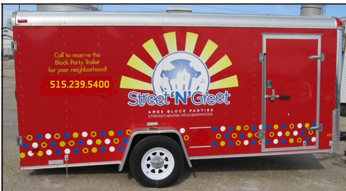
The Street 'N' Greet trailer is available for block parties.