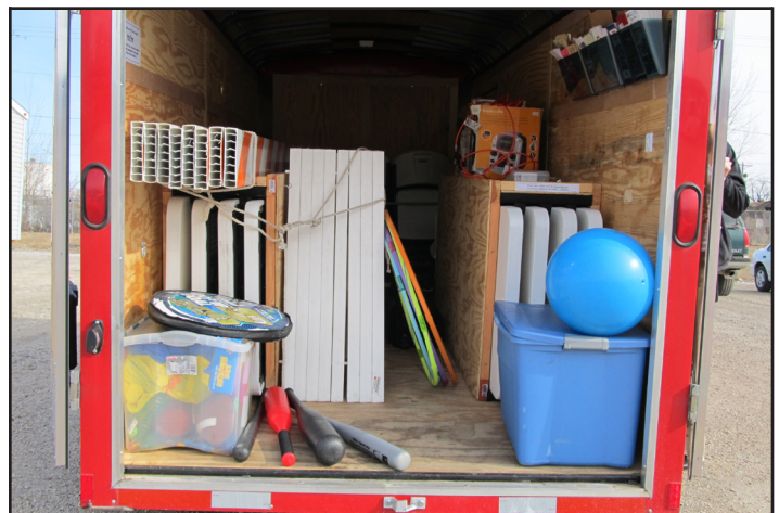
Street 'N' Greet trailer contents include tables, chairs, road barricades, children and adult games, audio system, and more.