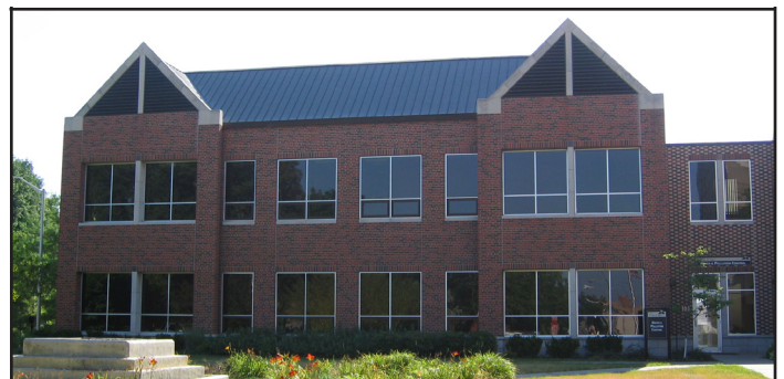
The City's Water Plant is located at 300 E. Fifth St.

The community is invited to the Water Plant Open House from 10 a.m. to 2 p.m. on Saturday, April 26, at 300 E. Fifth St. Displays will have a strong tie to the Ames sesquicentennial, showcasing the Water Utility's beginnings in 1891 all the way through to the plans for the new Water Plant that will come on line in 2017. There will be "behind the scenes" tours of the water plant, water meter shop, and laboratory, as well as many educational activities for both kids and adults.