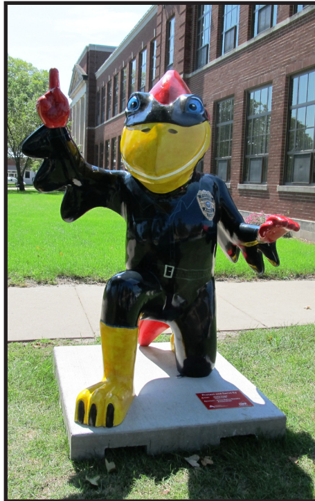
Protect and Serve Cy, sponsored by the Ames Police Benevolent Association, is one of the 29 Cy statues currently on "tour" in Ames. The statue faces Sixth Street on the northeast side of City Hall, 515 Clark Ave.

For more information on the project and to view a map of all Cy locations, visit www.cyclonecityames.com .