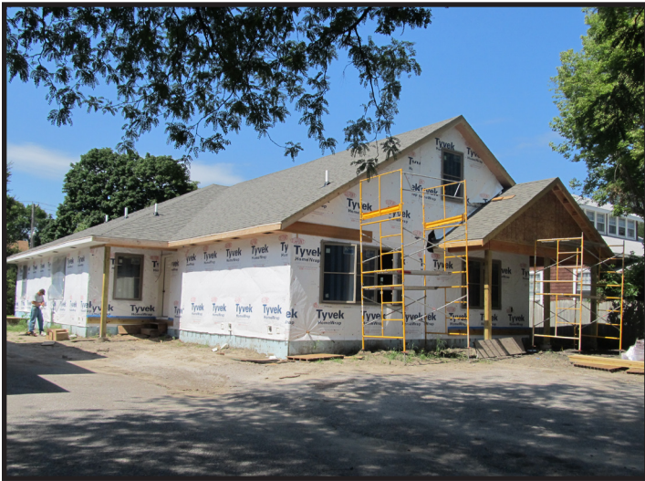
A new Habitat for Humanity home is under construction in the Old Town Historic District.

Habitat for Humanity of Central Iowa and Associated Builders & Contractors of Iowa have teamed up to build an accessible house for two quadriplegics. The house is located in the 800 block of Duff Avenue in the Old Town Historic District. The project has the neighborhood association very energized as it is uncommon to be building a new home in this historic district. The previous structure on the site was destroyed by fire a few years ago, thus creating an available lot within the district.