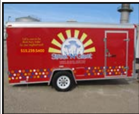
The Street 'N' Greet trailer holds a variety of items for use at neighborhood block parties.

The Street 'N' Greet trailer is available free of charge to Ames residents for use at neighborhood parties. Reservations for the 2015 season begin March 16, and the trailer may be reserved weekends from April 1 until the end of October.