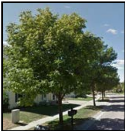
Ash trees along public rights-of way.

Trees targeted for removal will be posted with a sign, and residents in neighborhoods where tree removal is underway will be notified with door hangers. The EAB Response Plan addresses concerns with ash trees on public property. For more information on EAB and options for trees on private property, go to www.cityofames.org/trees .