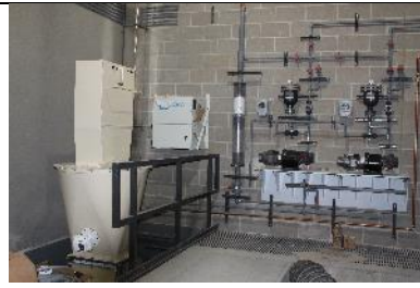
Fluoride feeder, pumps, and associated equipment being installed.