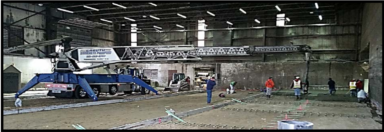
Replacement of the tipping floor at the Resource Recovery Plant