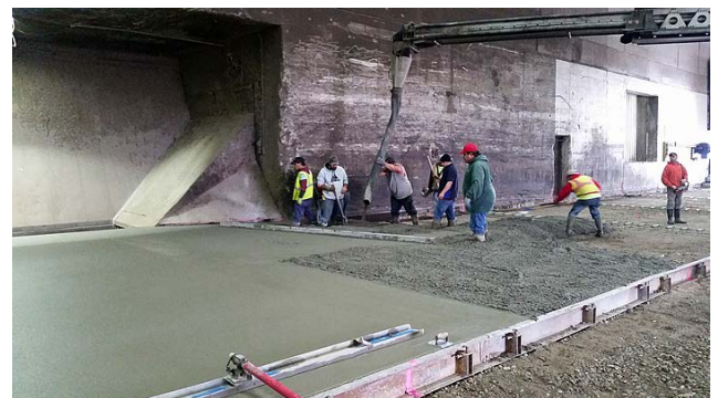
Above are more photos of the replacement work for the tipping floor at Resource Recovery