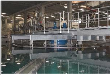
Solids Contact Unit No. 1 undergoing its final leak test prior to commissioning.