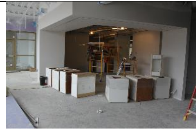
Cabinetry has been delivered and is being installed throughout the facility.