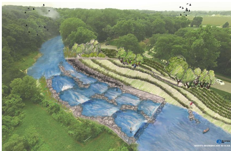
Conceptual rendering of the proposed modifications

In December, Council will be asked to issue a Notice to Bidders for the Low-Head Dam Modifications Project . This project includes elements of source water protection, aquatic ecosystem improvements, in-stream safety improvements, and bank-side park amenities.