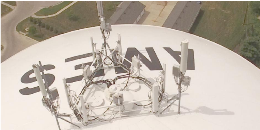
Aerial view of the existing Sprint and iWireless antennas on the Bloomington Road Elevated Tank (BRET)