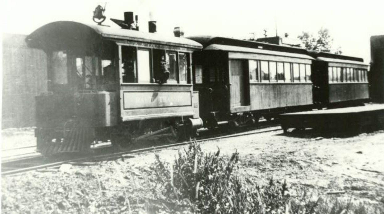
Figure 8. Circa 1900 photo of the Dinkey at the downtown terminal.