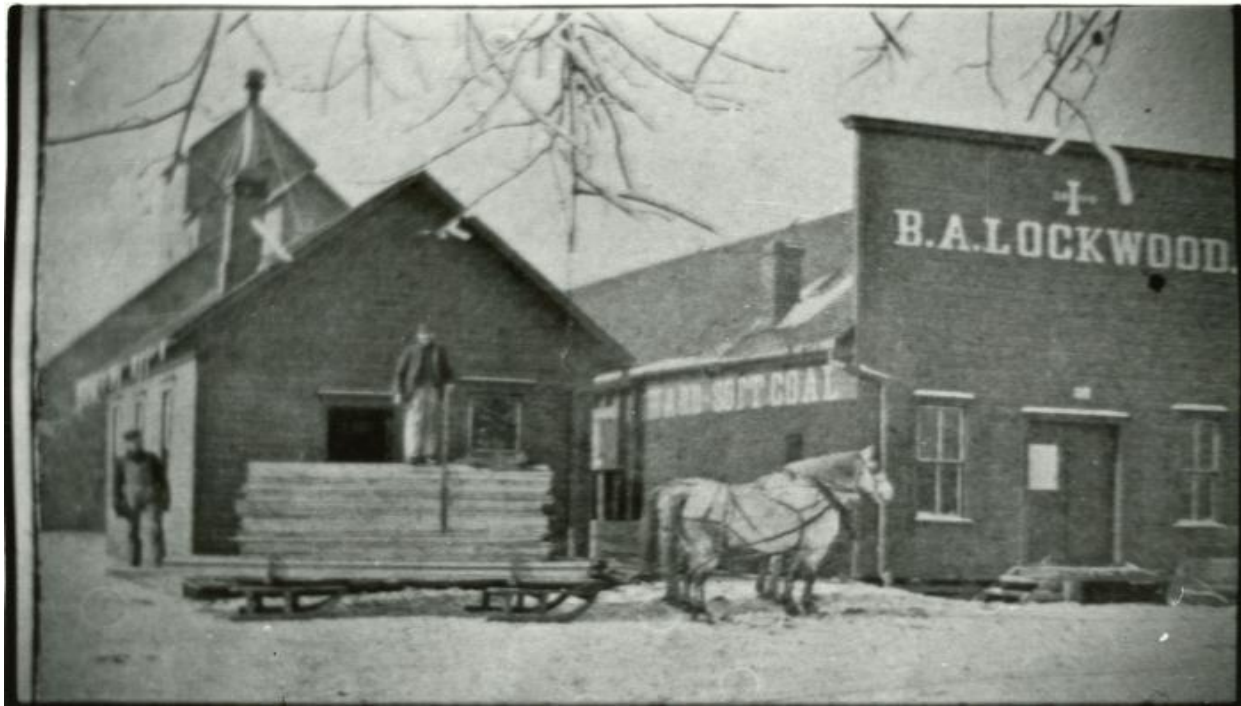
Figure 4. An 1897 photograph showing the typical wood-frame buildings which were present at the east end of Onondaga Street. Soon after, this style of building was replaced with the brick standard that remains prominent throughout the district.