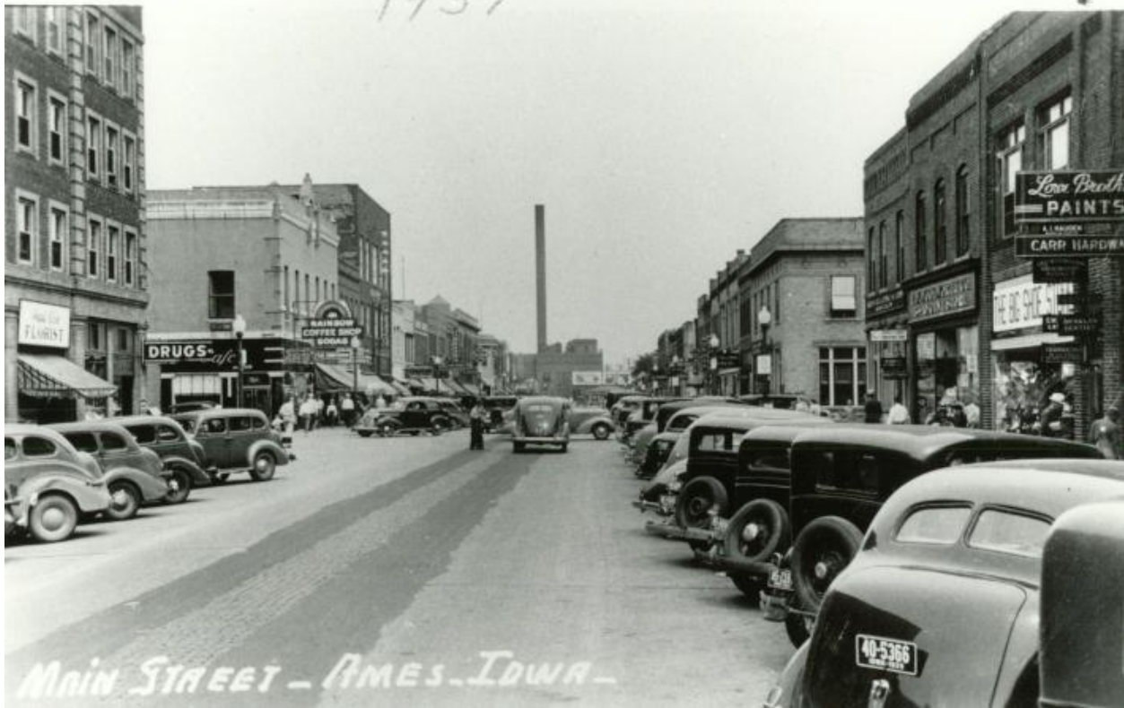
Figure 9. A 1939 Photo of Main Street looking east. The Sheldon-Munn Hotel is on the left at northwest corner of Main and Kellogg; the Rainbow Coffee Shop is at the northeast corner. On the southeast corner is the Ames Trust and Savings Bank. The streetcar tracks had been bricked over sometime after 1929 as seen in this picture.