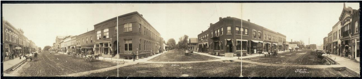
Figure 7. A panoramic view of the intersection of Main Street and Douglas Avenue