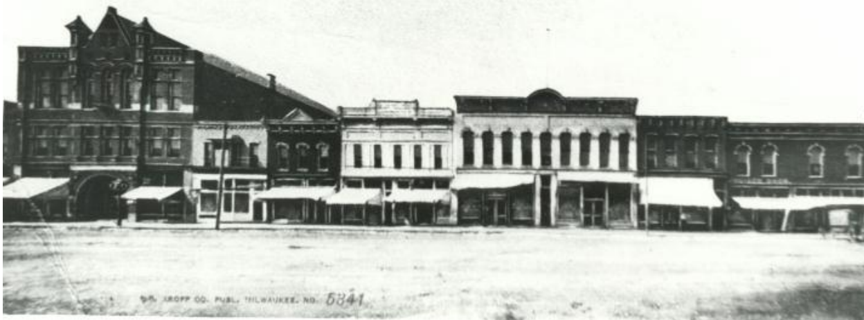
Figure 2. Showing the north side of Onondaga Street sometime before 1910. The Odd Fellows Building is the tall building on the very left. The Tilden Block buildings in right-center were built in 1883.