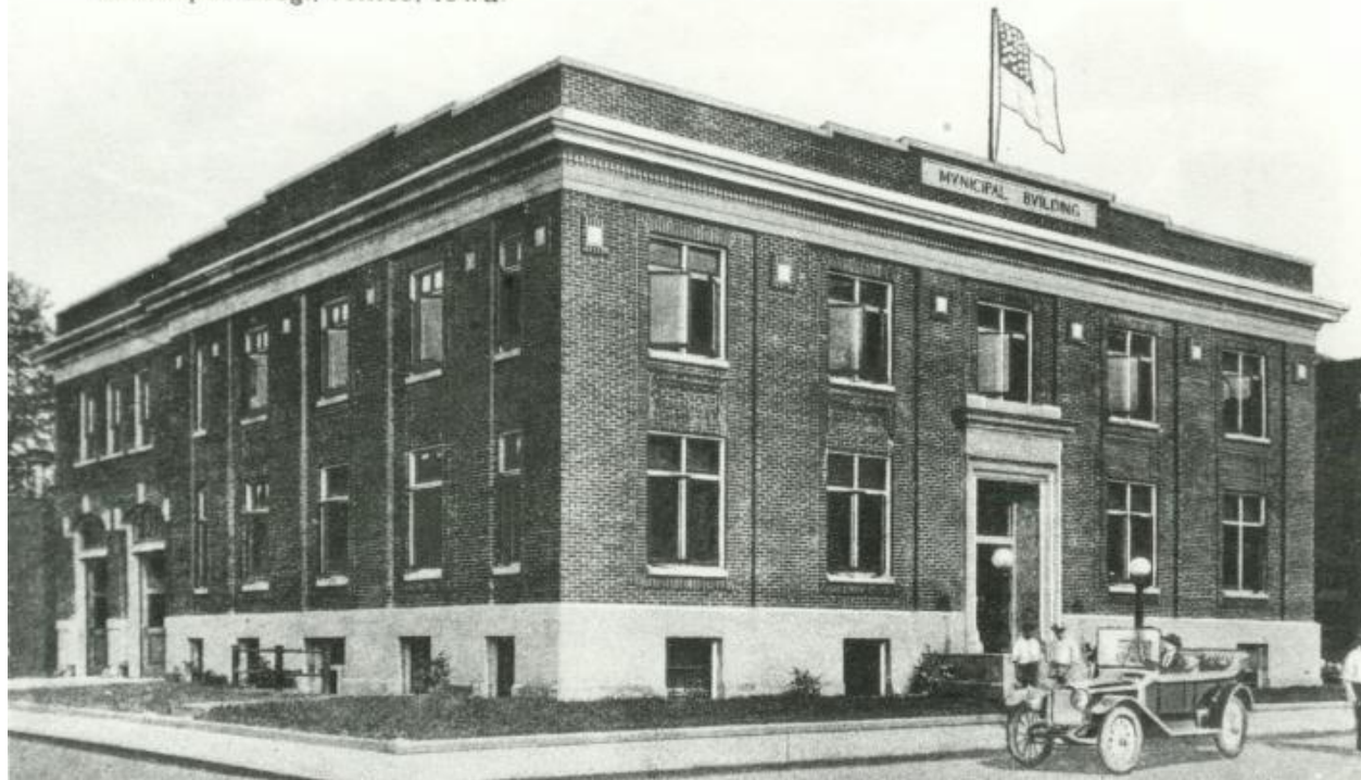
Figure 12. Postcard photo of the Municipal Building taken shortly after its completion