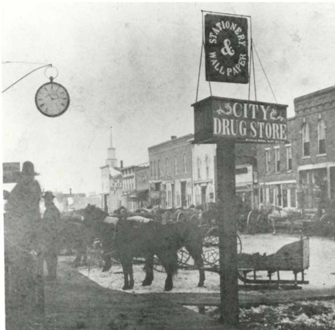
Figure 3. One of the earliest photographs of Ames' Main Street (Onondaga) taken in 1875