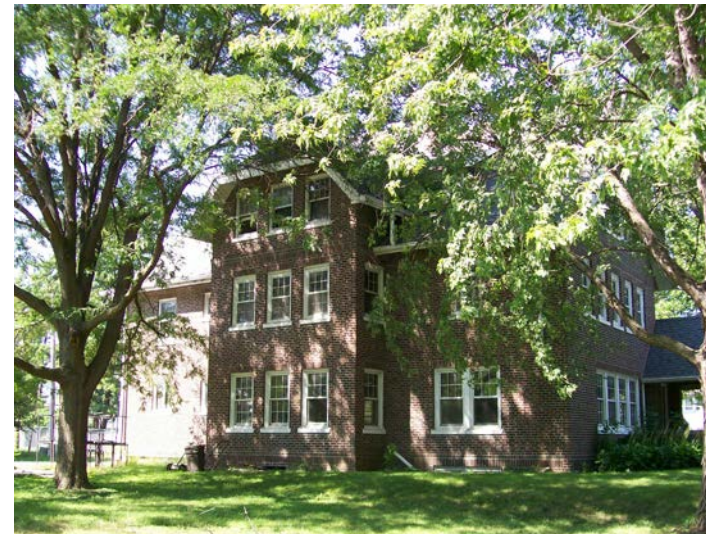
South Side Accessible entry to be added