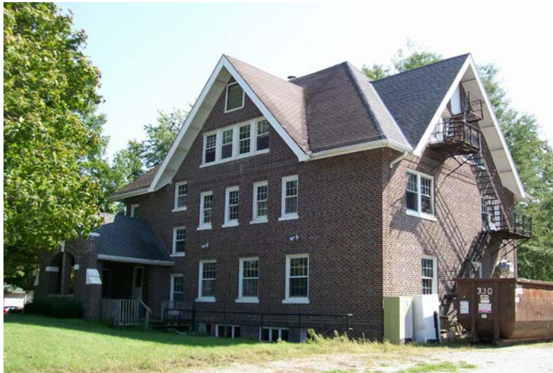
West Side Fire escape to be replaced