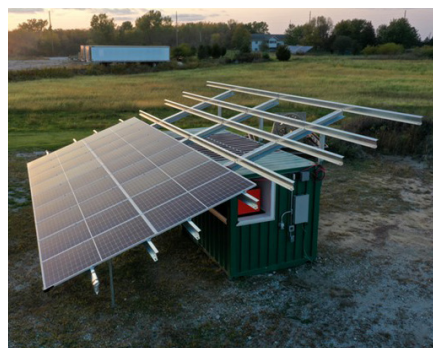
Above, the mobile microgrid has been placed just west of the Ames Power Plant. It offers free charging for electric vehicles (EVs). At left, is a close up of the mobile microgrid.

to collaborate with others to showcase creative renewable energy solutions for disaster situations like the derecho that Ames experienced this summer," Kom added.