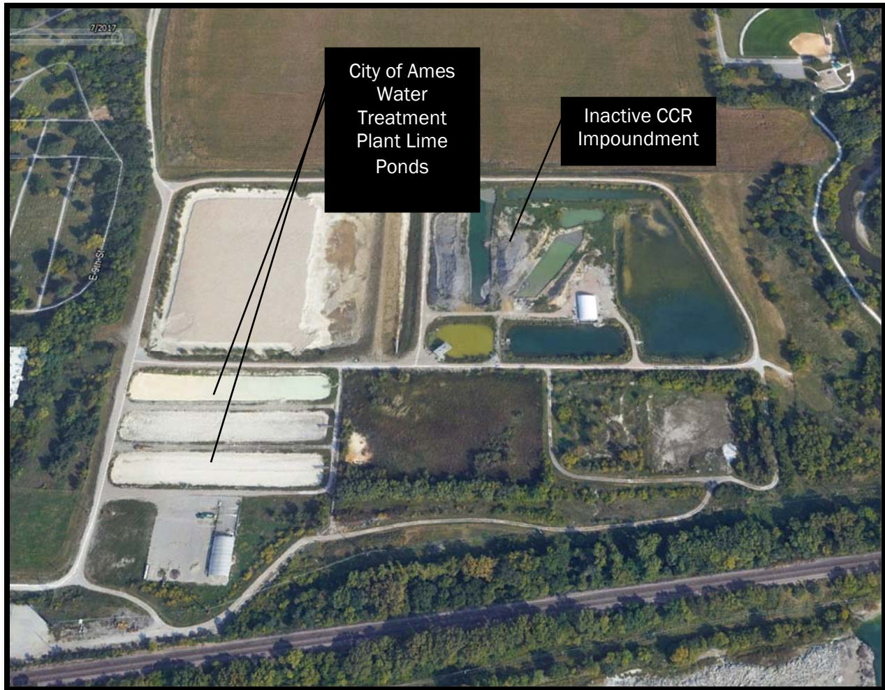
Figure 2 Site Photograph (Google earth, 7/12/2017)