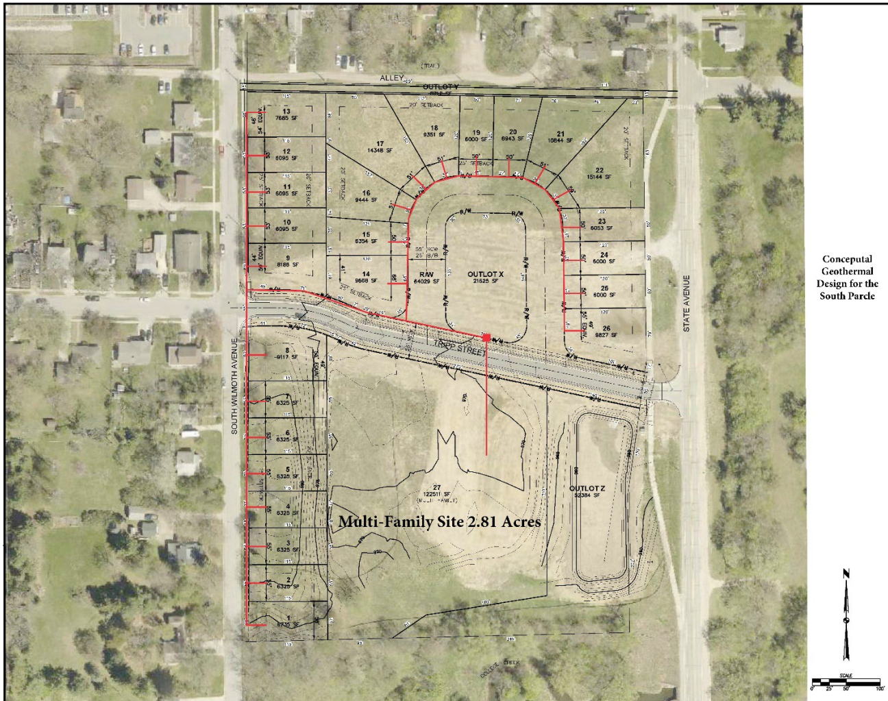
Conceptual Geothermal Design for the South Parcel