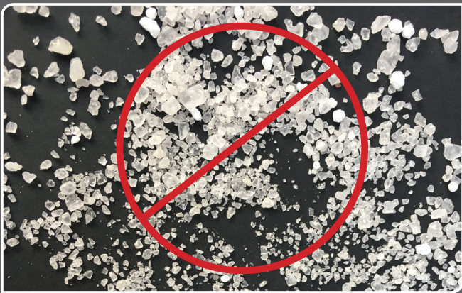
Excessive application of salt deicer for sidewalks, driveways, and parking lots. This can become a slipping hazard.