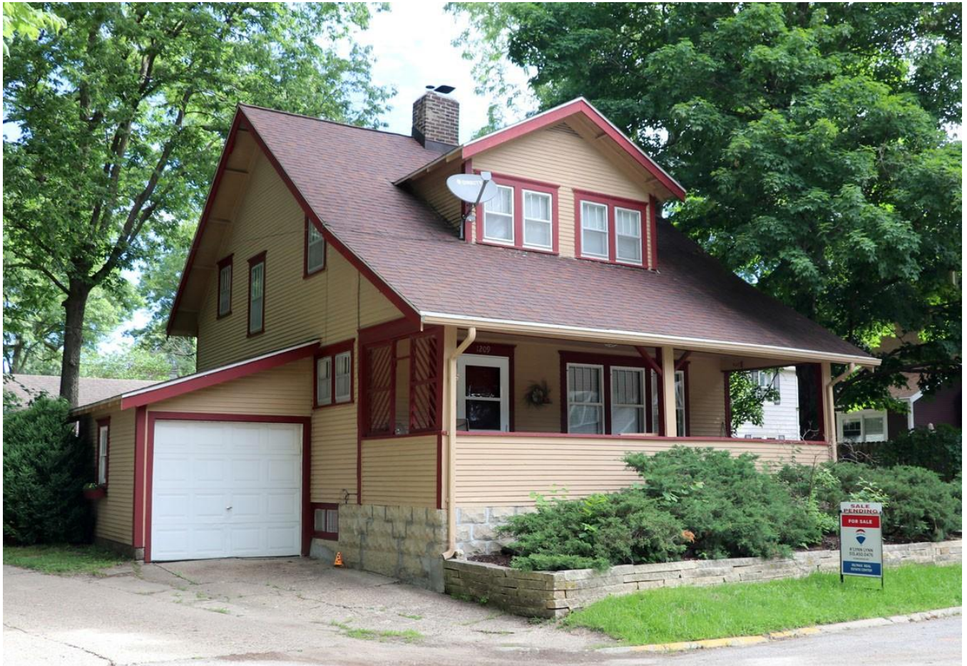
1209 Lee Street, Ames, Iowa