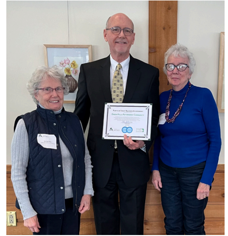
GREEN HILLS COMMUNITY