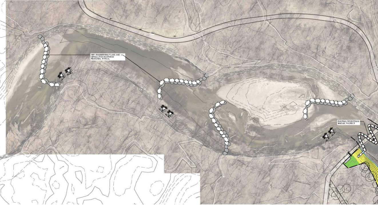
1 L101 PLANTING PLAN ENLARGEMENT